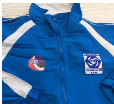
Club & Rally Logo on Front Rally Jacket Rally Jackets