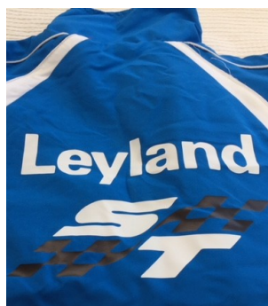
Rear of the Rally Jacket