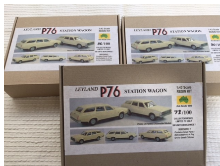
P76 Station Wagon Kits - $75 Unbuilt