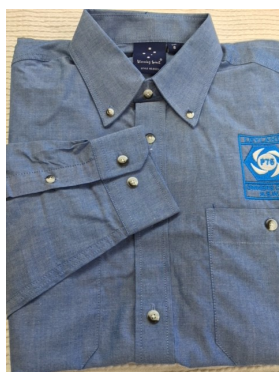
Blue Club Chambray Shirts $40